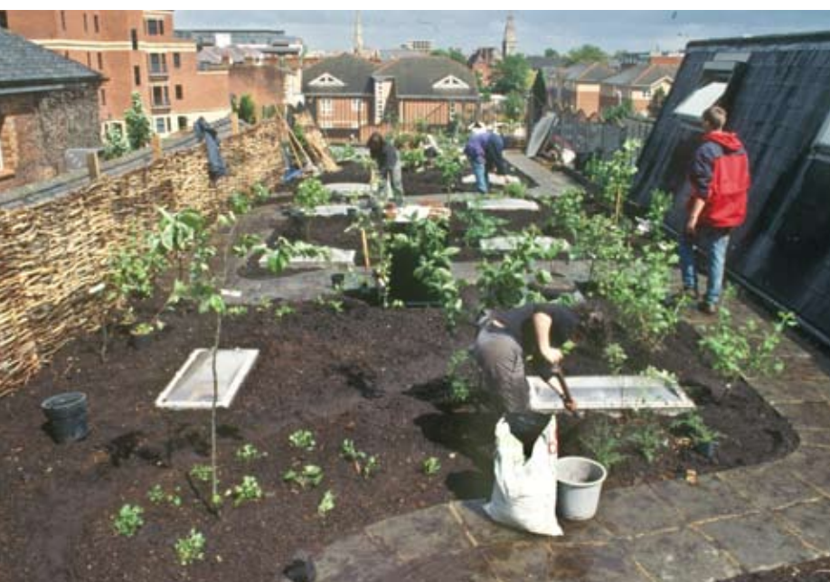
photos, from top: UV light gradually destroys roofing felt – by 2001 the roof had reached its sell-by date; work raising the surrounds to the skylights and installing the water and root proofing system began in October 2001; hard landscaping and planting was finished by June 2002

scope of RISC’s educational work but also appeal to funders. The Big Lottery took the bait and provided us with £34K topped up with a grant of £13K from SEED.