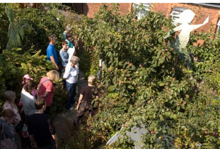
photos, from top: the garden has become an integral part of RISC's mission to raise awareness of global issues: it is open to the public on five weekends as part of the National Gardens Scheme; school groups come to the garden on field trips which allow them to discover the importance of plants in our lives, and have fun out of the classroom; performance of Crow! which explores Man's relationship to the environment

suffer from vertigo because we rarely see them. Another observation is that fungal disease is minimal. For example, interplanting seems to benefit commercial varieties of strawberry which have spread and prospered, even though it is recommended that they are replaced every year to prevent infection.