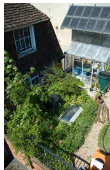
photos, from top: view of the layers of planting; the bed of useful native plants

So, the main message is: where land is available it is probably preferable to reduce costs and use low maintenance sedum or other extensive planting to gain the benefits of green roofs. In an urban context where land is often at a premium, green roofs have a part to play in urban agriculture. City Farmer, Canada's Office of Urban Agriculture, has produced an extensive list of successful aerial allotment projects from around the world 7 . However,