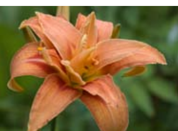
photos from top: globe artichoke ( Cynara scolymus ) is a both a delicacy and a sculptural plant; Ellison's Orange ( Malus domestica ) was bred in Lincolnshire in 1904; extracts from the purple cone flower ( Echinacea purpurea ) are used in many herbal remedies; Solomon's Seal ( Polygonatum ) are best known as a shade-loving ornamental, but the young shoots are delicious; root ginger ( Zingiber officinale ) produces beautiful flowers; right: ancient Emmer wheat ( Triticum diccocum ) is used to make organic wholemeal pasta in Italy

like conventional allotments, this form of productive green roof is relatively labour intensive. Our experience has shown that an intensively planted forest garden is a viable low maintenance option for owners, architects and developers to add to their palette. Such a garden scores highly on the habitat creation, amenity and food production levels, but requires higher capital spending, especially on structural strengthening and sustainable irrigation systems. A balance between keeping these costs to a minimum while creating the conditions best suited to a demanding planting scheme such as ours, would be to have 30cm of soil over the majority of a site, increasing to 50cm or more in areas devoted to trees, ideally on the south-facing edge which could take the additional loading and provide full sun for fruit trees.