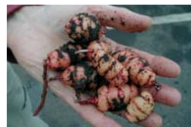
photos, from top: layers in the RISC forest garden: trees - hazel ( Corylus 'Webb's Prize'); edible shrubs - chokeberry ( Aronia melanocarpa ); herbaceous perennials - angelica ( Angelica archangelica ); ground cover plants - wild strawberry ( Fragaria vesca ); climbers - Japanese wineberry ( Rubus phoenicolasius ); edible roots and tubers - oca ( Oxalis tuberosum )