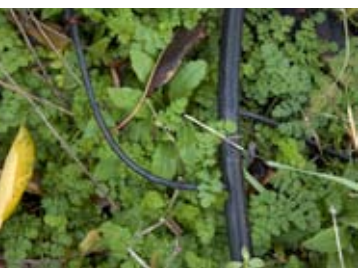
photos, from top: water from the garden and surrounding roofs percolates through the soil – a layer of fleece prevents clogging of the drainage layer below, which sits on insulation and the special root-proof felt; any remaining particles collect in the green sedimentation tanks and is pumped into the grey 1500 litre storage tank; in the summer water is pumped to a drip-feed irrigation system, timed to switch on at night to reduce evaporation

has matured into a truly beautiful, inspirational oasis that has won awards, astonished the hundreds of people who visit every year and attracted great media interest. However, there are important lessons we have learnt which will make it easier for others to follow in our footsteps.